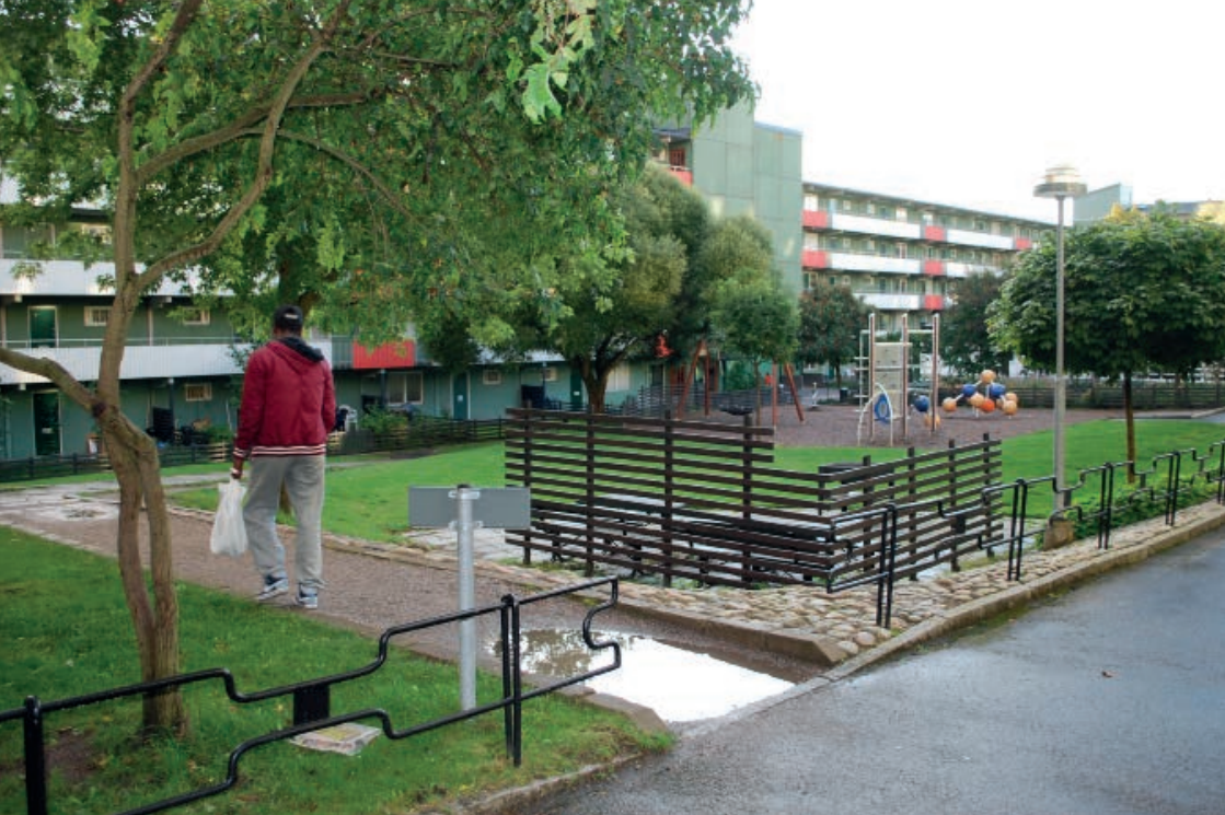
Figure 1:2. Courtyard in Husby.