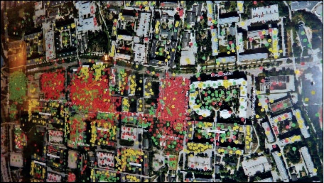
Figure 2:2. Aerial photo over Husby, exhibited in Järvalyftet's Dialogue Office (Järvadialogen) in Husby.

removal of two, the second of six out of eighteen pedestrian bridges (Stadsledningskontoret et al, 2011). The removal of the pedestrian bridges, and raising the level of the motor vehicle trafficked road was to make the construction of a new street connecting Husby to the adjacent IT cluster Kista possible. This street was to raise the influx of people in Husby, and enable the planned "Culture House" at the northern train station exit to economically sustain itself, since Husby would be easily accessible for drivers (ibid.).