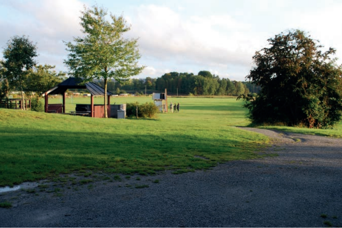
Figure 1:1. Järvafältet (the Järva Field).