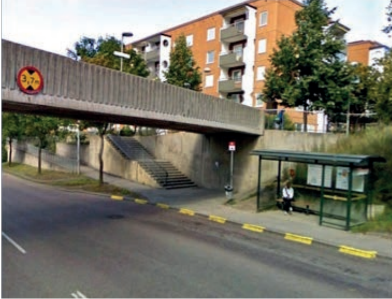
Figure 1:3. A pedestrian bridge over Norgegatan in Husby.