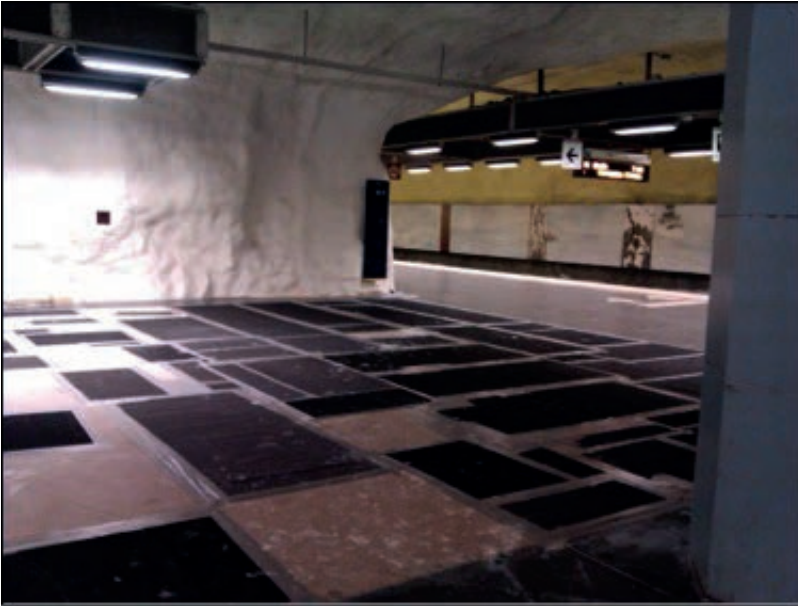
Figure 3:1. Husby's train station.